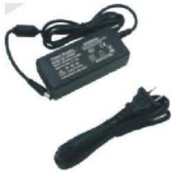
AC/DC adapter with power cord